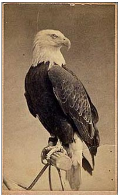
Old Abe, the veteran of many battles as the mascot of the 8th Wisconsin Infantry. The eagle died in 1881 and was stuffed and mounted for public display.

As we noted in the last issue of The Sentinel , a brilliant series of lectures by the noted scholar David W. Blight are available free for download via the iTunes store: http://www.apple.com/itunes/download . We have since learned that it can also be accessed at http://oyc.yale.edu/history/civil-war-and-reconstruction/ . This site has the original course syllabus and reading list for a history class at Yale and, unlike the original students, no papers will be due.