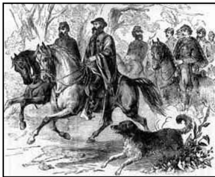
General Asboth and his dog York gallop at the battle of Pea Ridge. From Frank Leslie's Illustrated Weekly.

It's not Avatar , but an interesting way to literally look at the Civil War is to study the stereoscopic photos that were the rage of the day during the war years. It takes a bit of visual "self-training," but it's fun and interesting to see what the "technology of the day" was in the 1860s and think about how it brought the war into people's living rooms, perhaps in a way similar to the way the Vietnam war was brought into our living rooms by the media in the 1960s. While there are some books out on this subject, complete with 3-D glasses, the Civil War Preservation Trust now has an on-line site where you can experience this on your own. You will need the special 3-D glasses, and there are directions on the website on how to get them for free. For more, go to http://www.civilwar.org/photos/3d-photography-special .