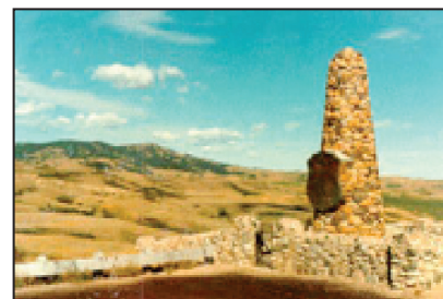
...the fort today.